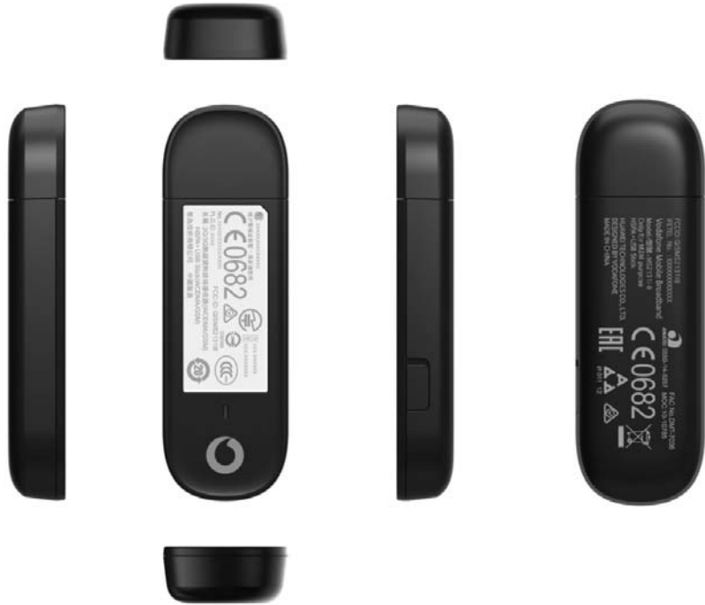
Figure 1-1 MS2131i-8 profile